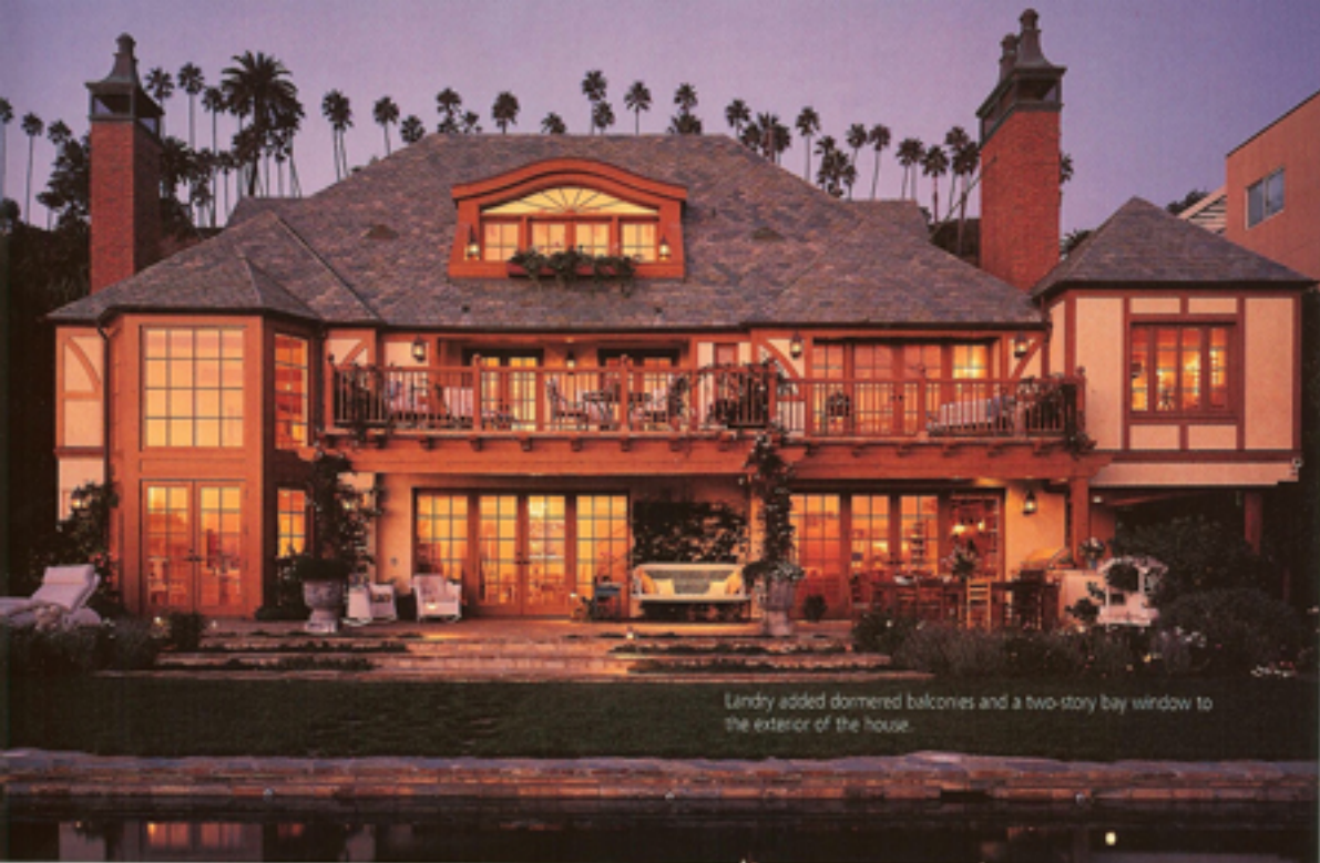
Landy added domered balconies and a two-story bay window to the exterior of the house.