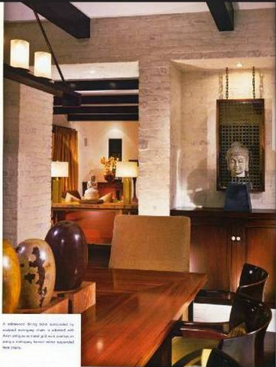
A teakwood dining table surrounded by upholstered dining chairs is adorned with Asian artifacts as metal grid work carries an antique sculpture, hand-mixed suspended floor chairs.