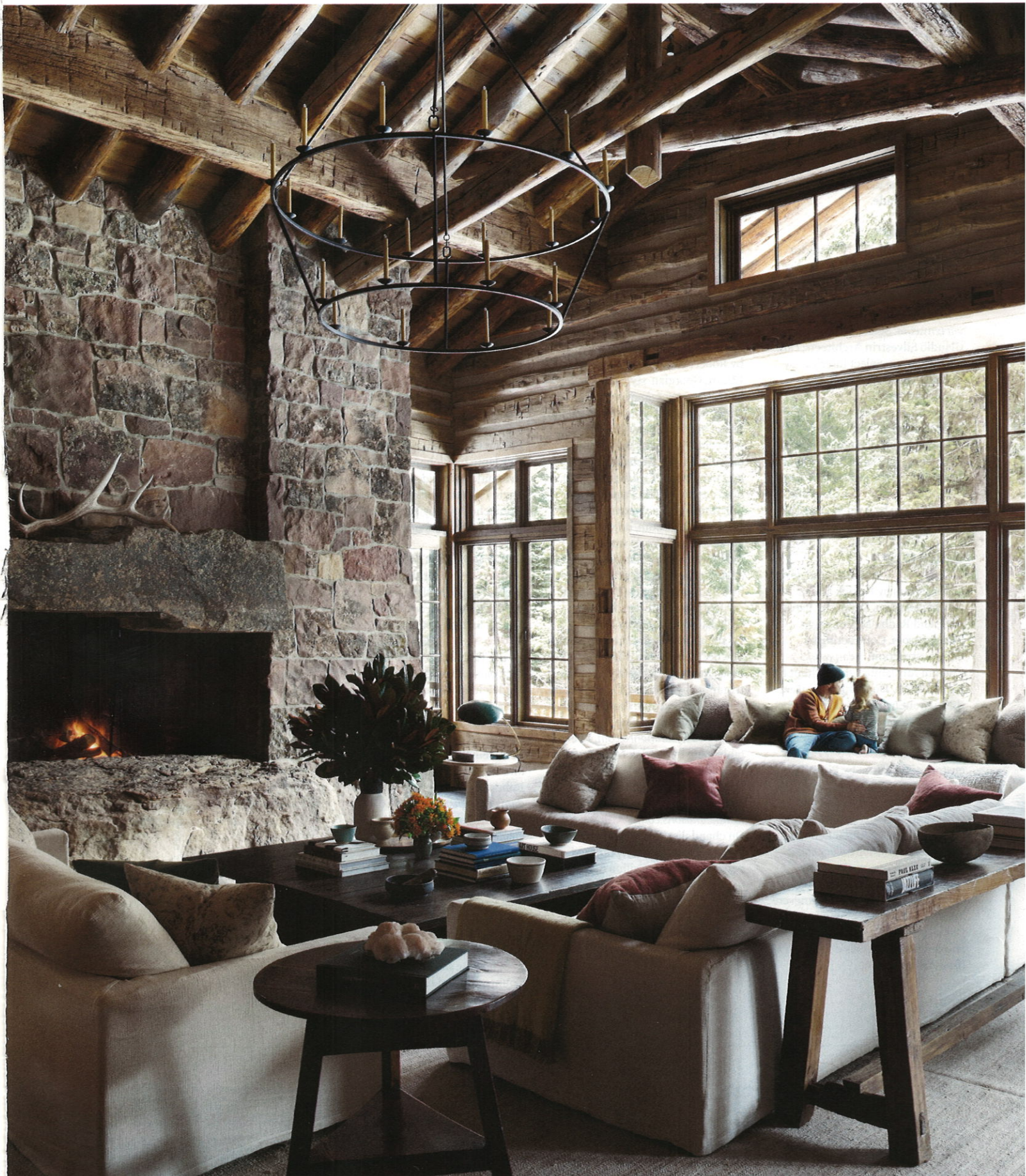
THE LIVING ROOM FEATURES A SIXPENNY SECTIONAL AND ARMCHAIRS. CUSTOM CHANDELIER BY ADG LIGHTING; ROUND SIDE TABLE (IN FOREGROUND) FROM OBSOLETE; PILLOWS OF RALPH LAUREN HOME AND HOLLAND & SHERRY FABRICS.

★ EXCLUSIVE VIDEO AARON PAUL AT HOME, ARCHDIGEST.COM .